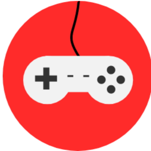
Image Description: Illustration of a grey and black video game controller, inside a red circle

Because of the shelter-in-place order, you won't be able to go to some of the places you probably liked to go to, do the things you usually do for fun, or hang out with people you usually love to hang out with before the COVID-19 outbreak. You may feel alone, sad, and bored because of how COVID-19 changed the way you like to have fun.