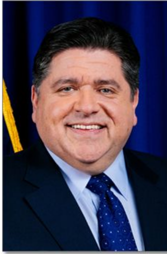
Image Description: Smiling middle-aged man with pink complexion, black and grey hair, wearing a navy blue suit, light blue shirt, and dark blue tie

On March 20 th , 2020, Illinois governor JB Pritzker placed a “ shelter-in-place ” order, which started on Saturday, March 21, 2020 at 5pm . Some people also call it the “stay-at-home” or “stay-in-shelter” rule. For now, it will last until May 30, 2020, but Governor Pritzker could make it last longer if the coronavirus outbreak doesn’t end soon. All cities and towns in Illinois must follow Governor Pritzker’s order.