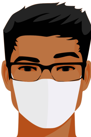
Image description: Illustration of a person with medium complexion and black hair, wearing eyeglasses and white mask covering their mouth and nose

As of April 23, 2020, Governor Pritzker requires everyone to either wear a cloth mask or wear something to cover your mouth and nose in public, especially when you are going to places where it is harder to practice social distancing (like grocery and retail stores). The Center for Disease Control, or CDC, also recommends people to cover their faces when going out in public; they have tips on the following websites where you make your own cloth masks or find something to cover your mouth and nose if you don't have cloth masks: