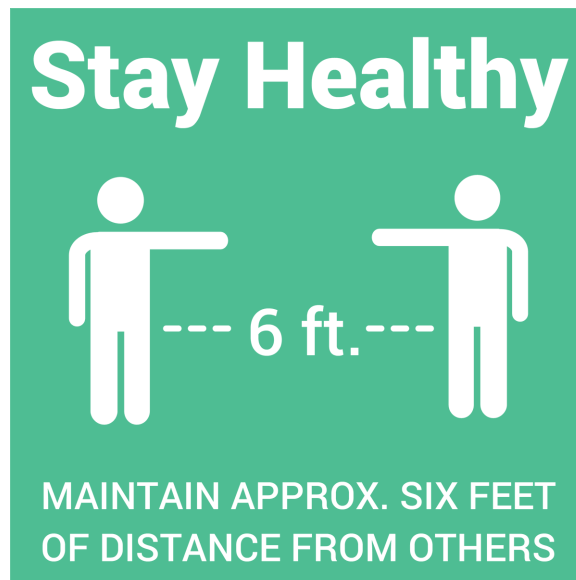
Image Description: Green sign that reads "Stay Healthy; Maintain Approx. Six Feet of Distance from Others". In between words are two people pointing at each other, and between the two people is a series of dotted lines and the word "6 ft".

Social distancing, also called "physical distancing," means keeping space between yourself and other people outside of your home. To practice social or physical distancing: