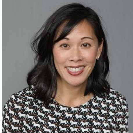
Image Description: Smiling woman with peach complexion, long black hair, wearing a black and white shirt