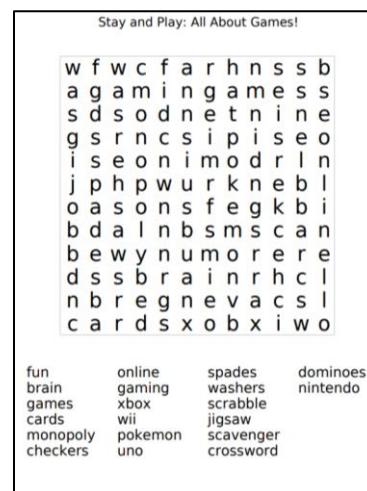
Word Search Puzzle