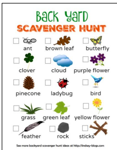
Backyard Scavenger Hunt