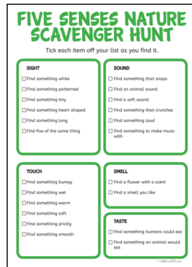
Five Senses Scavenger Hunt