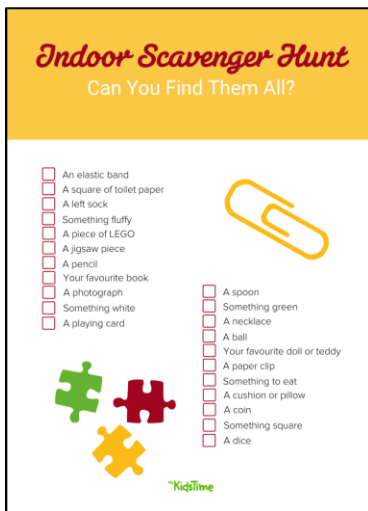
Indoor Scavenger Hunt

Check out the downloadable activities from the webinar below!